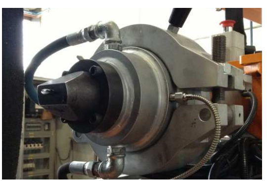
CI-MASTER SKF 35